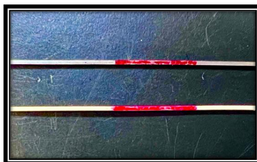
Figure (4): The portion of the wire's outer surface that did not come into contact with the bracket slot is marked with a marker to indicate the area that slid along the slot.