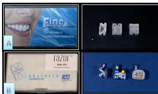
Figure (2): A: Monocrystalline sapphire clear aesthetic brackets (HUBIT Co., Ltd. Gyeonggi-do, South Korea). B: Razor Stainless steel metal bracket (International Orthodontic Service IOS™, California, USA).